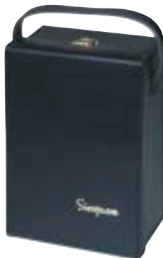
Model No. 00805