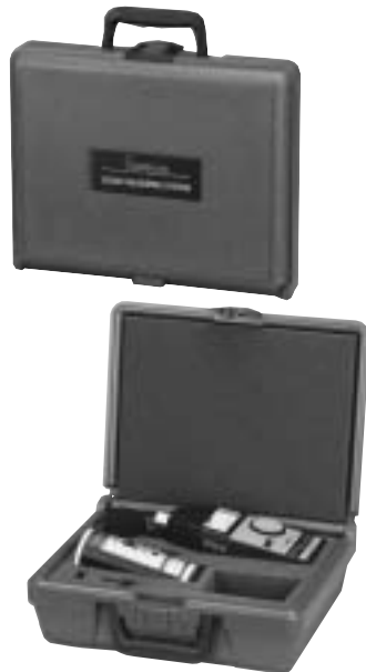
Model No. 45028